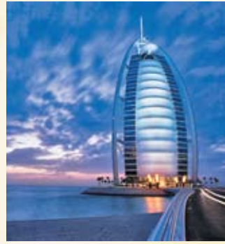
Burj Al Arab