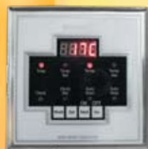
4 in 1 Digital Timer