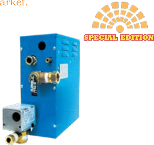
Steam Ranger™ RV9 Steam Unit

Steam Sauna is proud to introduce an innovative technology for next generation of residential steam bath products that rises above all conventional steam bath units in the market.