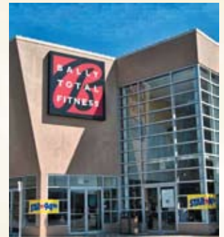
Bally Total Fitness