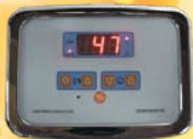
Blue Designer Control