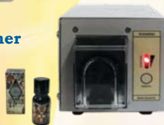
Automatic Scent Dispenser