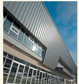
Hillcrest Park Recreation Centre - Olympics 2010