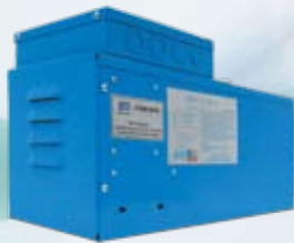
Regular Series RS50, 100, 150, 250