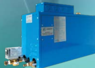
Commander Series CS15AF, 18AF