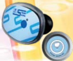
30 Min In Room Touch Timer