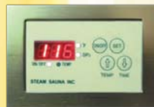
Advance Blue Designer Control