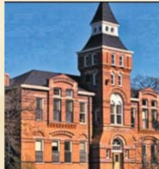
Michigan State University