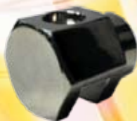
Steam Head with Reservoir