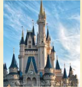
Walt Disney World