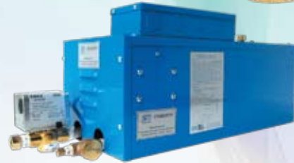
Regular Series RS300AF, 400AF

*For size over the above range, please contact manufacturer