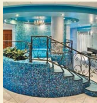
The Elmwood Spa