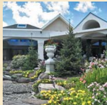
New York Country Club