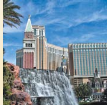
The Venetian Hotel